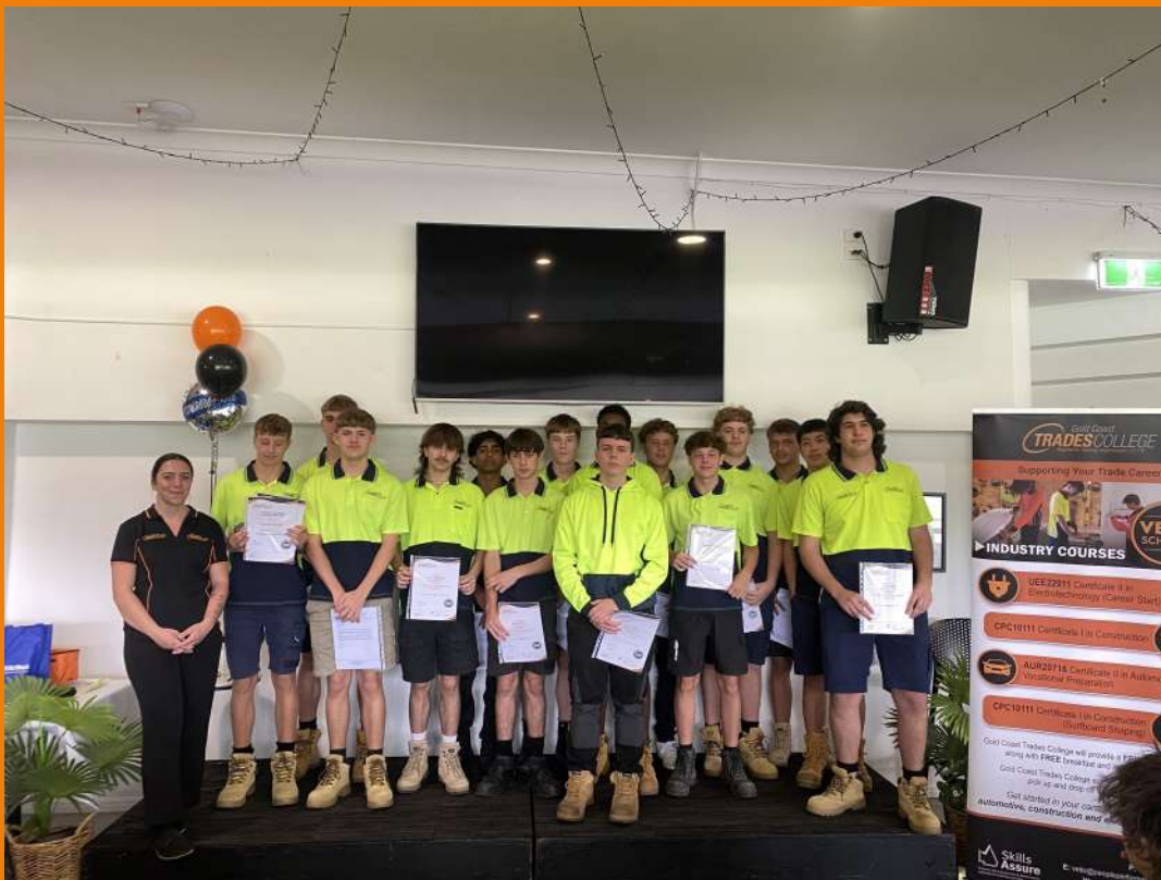
One of our Thursday Certificate II in Electrotechnology classes above