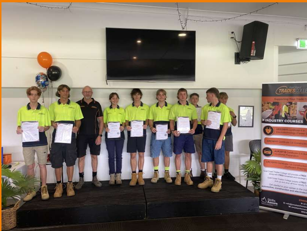
One of our Friday Certificate II in Electrotechnology classes above